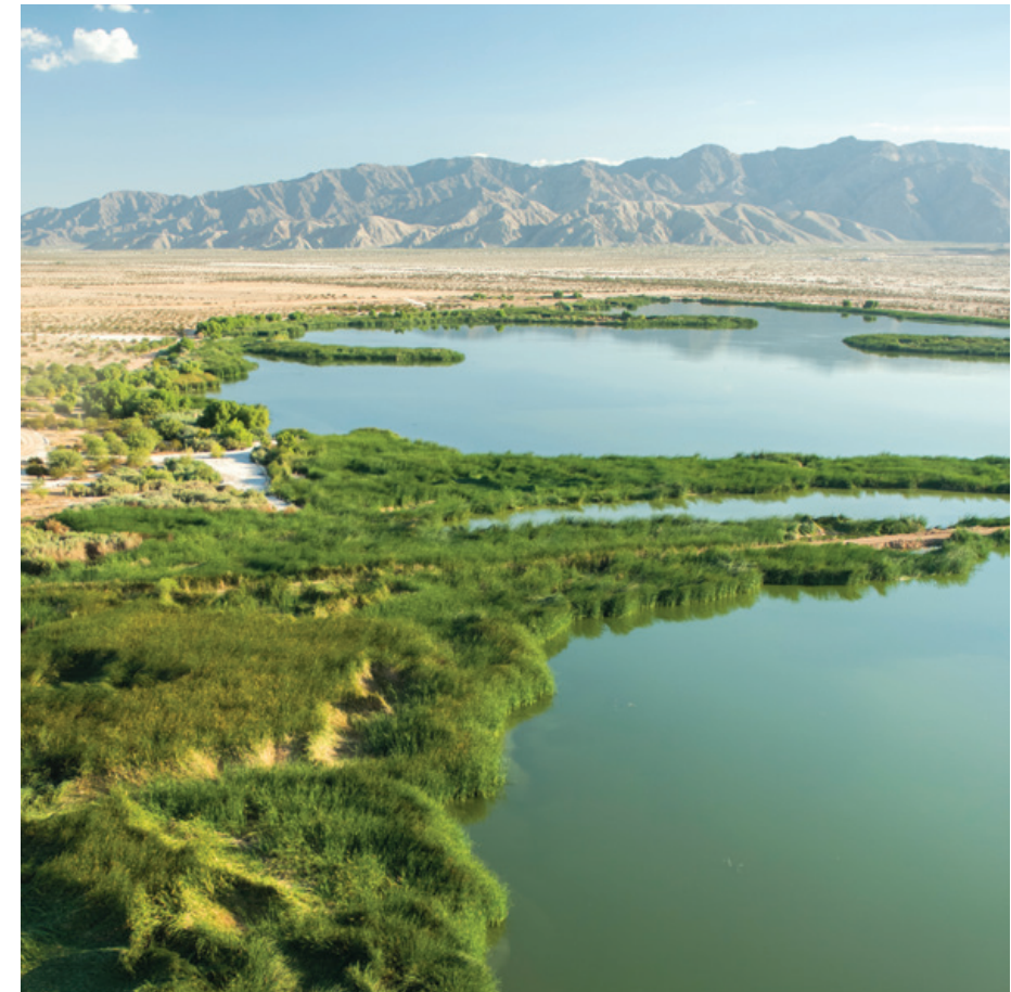
Las Arenitas Water Treatment Plant wetlands