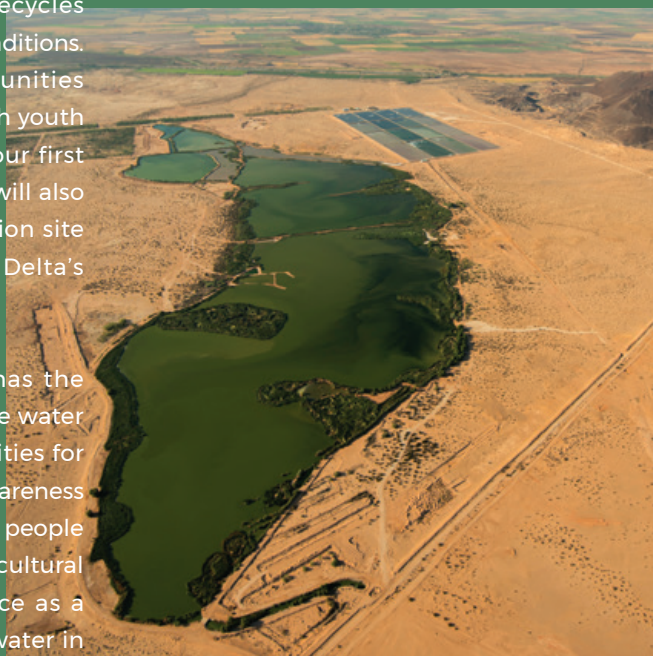
Las Arenitas Water Treatment Plant wetlands

Removing built-up sediment from the main channel in the estuary allowed the lower 50 miles of river flows to meet the sea an estimated 171 days during 2018, up from 18 days in 2011. The number of bird species recorded in the estuary increased 47% between 2018 and 2019.