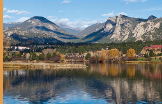
Estes Park, Colorado